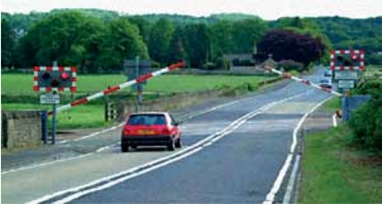
Automatic half-barrier level crossing